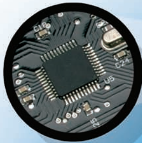
Soft-Stop / Soft-Start with intelligent Obstruction Detection