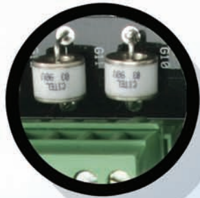
On-board lightning protection

The H-10™ gate operator has the capacity to operate slide gates up to 2000 lbs. and 45 feet in length at 100% duty cycle under extreme conditions. It's efficient mechanism provides a solution for high traffic commercial slide gate applications. The Viking H-10™ gate operator offers efficiency and technology combined in a single package. This operator is UL Listed 18TC UL325 and UL991.