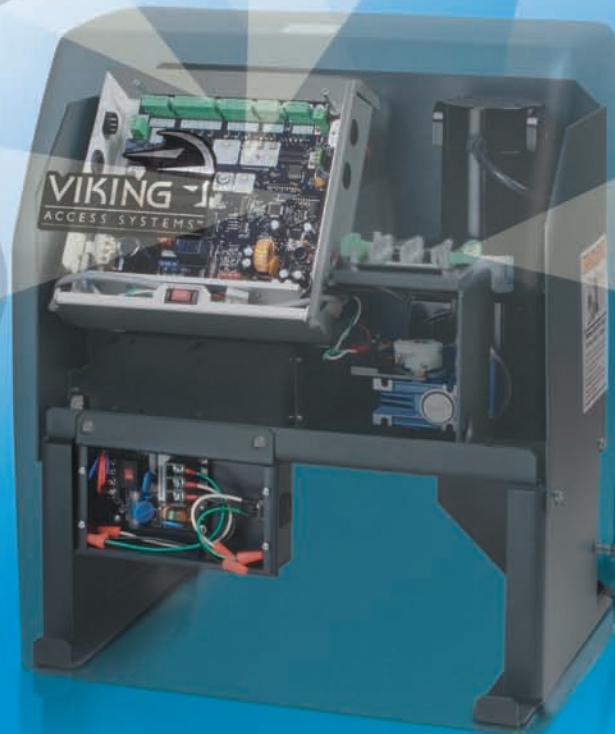
Back-drivable unit features direct drive mechanism