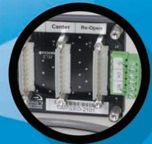
Loop rack included