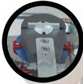
Fail-Safe / Fail Secure clutch mechanism

The standard specifications and features of this gate operator showcase the commitment made in its concept and design. Whether it's the simple, clean installation, energy efficient operation, or advanced battery backup function, this operator stands alone in it's class. This operator is UL Listed 18TC UL325 and UL991.