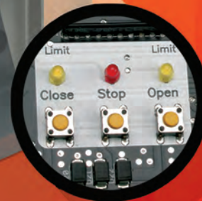
Built-in three push button station